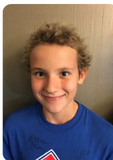
'A' OLE ALOHA