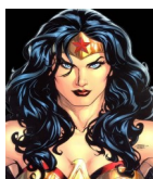
Leigh "Wonder Woman" Tharrington