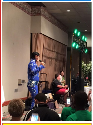
Elvis impersonator entertained a standing room only crowd of athletes at tonight's athlete's social. It was all that and a plate of catfish!